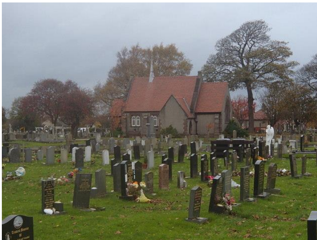
Torrisholme Cemetery Grounds & Chapel

Torrisholme Cemetery contains 59 Commonwealth War Graves – 17 relate to World War 1 & 42 relate to World War 2.